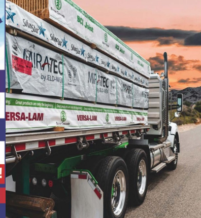
Serving Lumber & Building Material Dealers for over 60 years